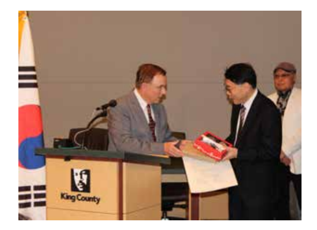
With Korean Consul General Hyung-jong Lee.

On January 22, members of the King County Council joined me in welcoming the new Korean Consul General Hyung-jong Lee to King County and recognized Pyeongchang, South Korea, for hosting the 2018 Winter Olympics. It is often said that the 20th century was the century of the Atlantic Ocean, but that the 21st will be the century of the Pacific Ocean. In this spirit we celebrated continued strong relations between our two nations.