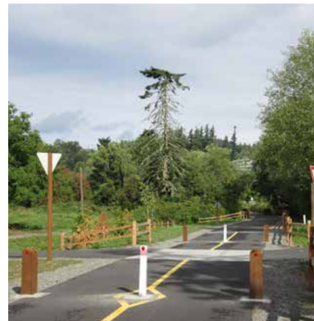
Intersection in Issaquah trail segment after trail construction

The trail's narrow corridor, limited trail access, sensitive areas, and steep terrain all contribute to the challenge of constructing the trail. These factors limit the contractor's ability to perform multiple activities at the same time. There are also seasonal constraints on when construction activities near streams can occur. ELST trail segments in Sammamish are particularly challenging because of the trail's close proximity to residences and many intersecting driveways and property access points along the corridor.