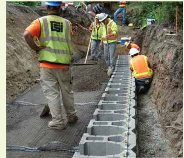
Construction retaining wall on Redmond trail segment.

Access to private properties and driveways will be maintained throughout construction.