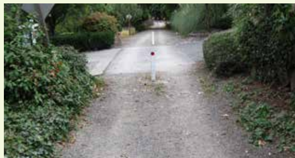
North Sammamish trail segment before.