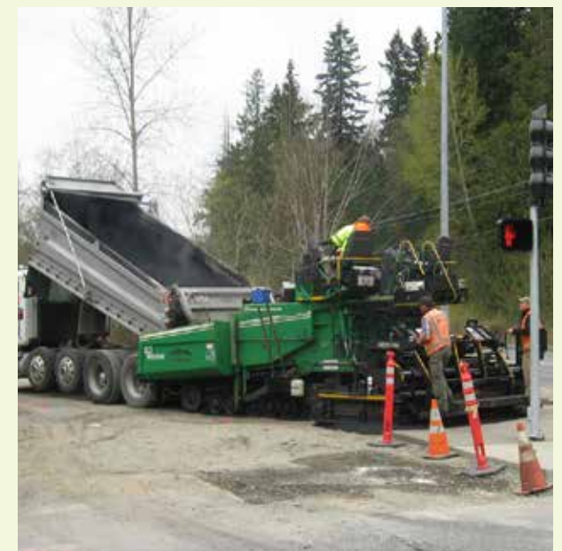
Placing asphalt on Issaquah trail segment.