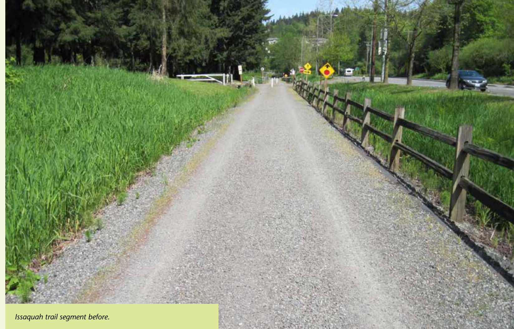
Issaquah trail segment before.