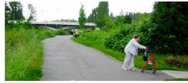
Sammamish River Trail

The East Lake Sammamish Master Plan Trail (ELST) is an alternative non-motorized transportation corridor and multi-use recreational trail along 11 miles of former Burlington Northern Santa Fe (BNSF) railroad corridor on the east side of Lake Sammamish, from Redmond to Issaquah. King County purchased the corridor in 1998 and opened an interim gravel trail in 2006. King County Parks (Parks) has spent more than 10 years on master planning, design work and environmental review for this project, with ongoing involvement of a citizen’s advisory group and close coordination with the cities of Redmond, Sammamish, and Issaquah.