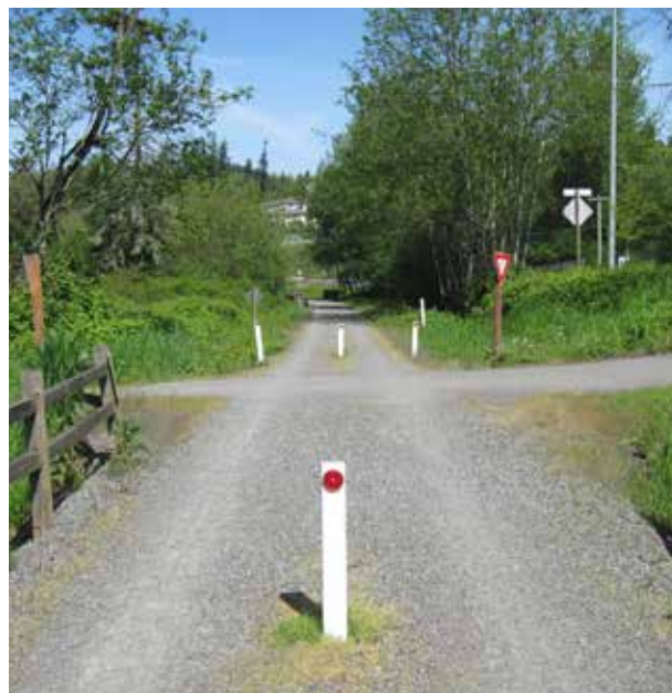
Intersection in Issaquah trail segment prior to trail construction