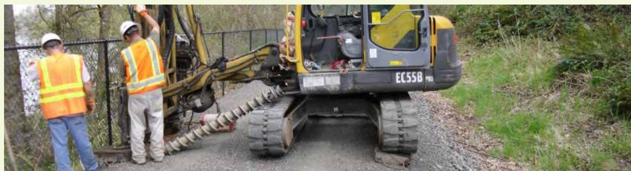
North Sammamish trail construction will begin April 1

There may be short-term construction activity at intersections where private driveways cross the trail, however access to private properties will be maintained at all times. Emergency response services access will also be maintained during construction.