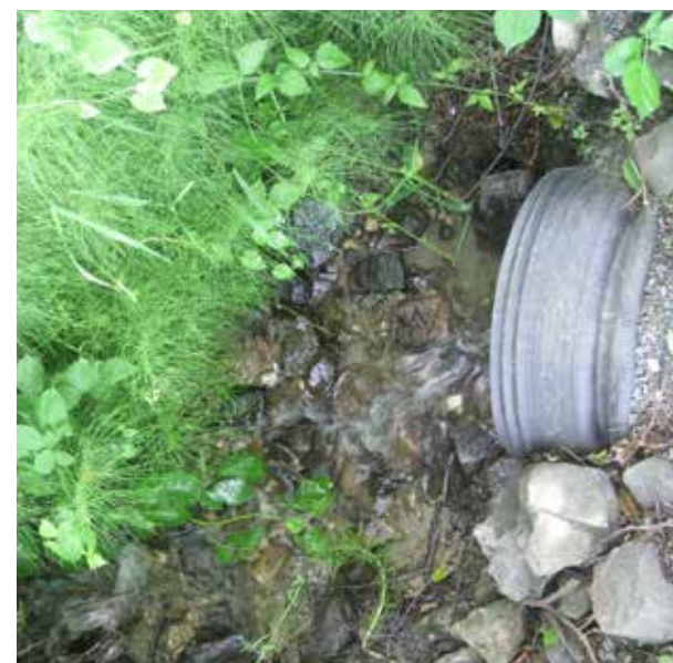
The North Sammamish segment includes building four culverts to enhance fish passage and improving approximately one acre of habitat. Design of similar enhancements will be included in the South Sammamish segment.

or excess moisture; they require less maintenance, growing to natural sizes and forms; and they blend well into the natural surroundings along the trail corridor