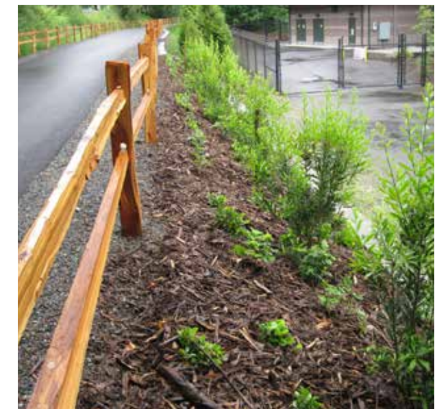
Trees are planted at least 10 feet away from the trail to promote healthy growth and prevent roots from damaging the new asphalt trail

Trail safety is King County's top priority. Stop signs along the existing gravel trail do not meet national trail development guidelines, including those stated by AASHTO and the Manual on Uniform Traffic Control Devices. These stop signs will be removed and replaced with consistent and appropriate signage. Additional information regarding stop signs on the trail can be found on the project website.