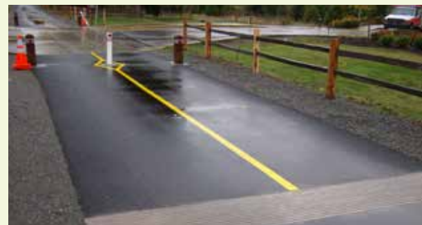
Improved intersection on the Redmond segment