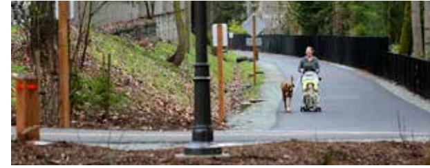
Burke Gilman Trail