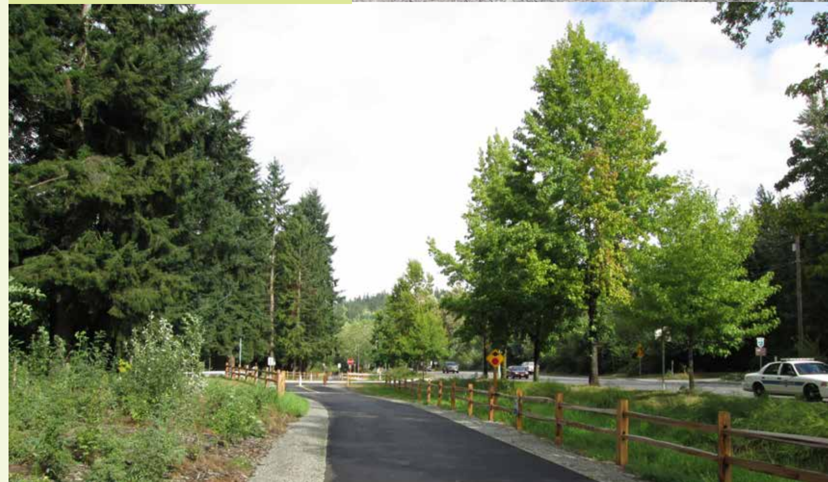
Issaquah trail segment after.