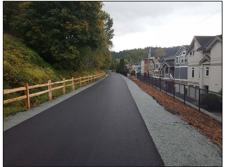
Continued split rail fence installation.