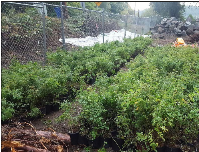
Some nootka rose bushes delivered to the project ready for planting!