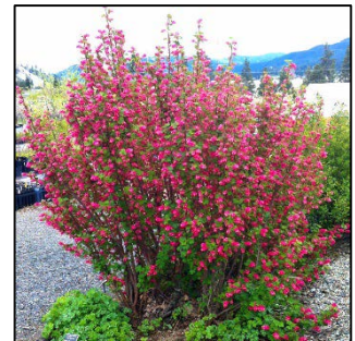
Red Flowering Currant