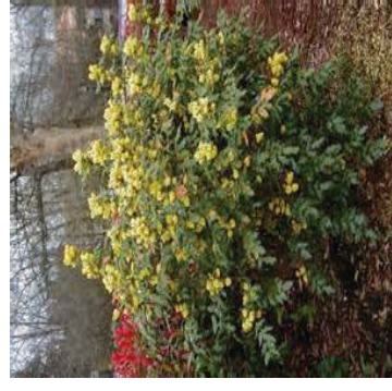
Tall Oregon grape 4' to 8' tall 3' to 5' wide Evergreen