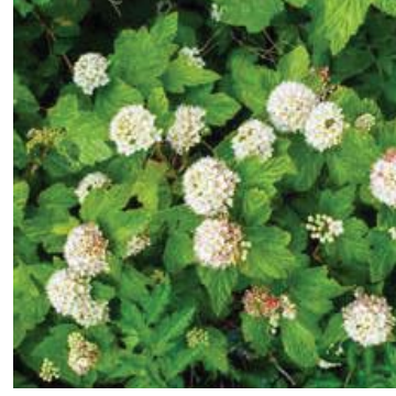
Pacific Ninebark shrub 8' to 15' tall 8' to 15' wide White flowers