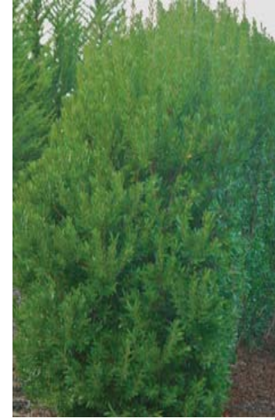
California Wax Myrtle 15' to 20' tall 8' to 15' wide Broadleaf evergreen Solid screen, native 6' wide min. area required