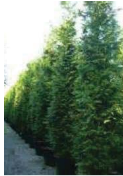
Excelsa Cedar 30' to 40' tall 10 to 15' wide Evergreen conifer Solid screen, trim to hedge 6' wide min. area required