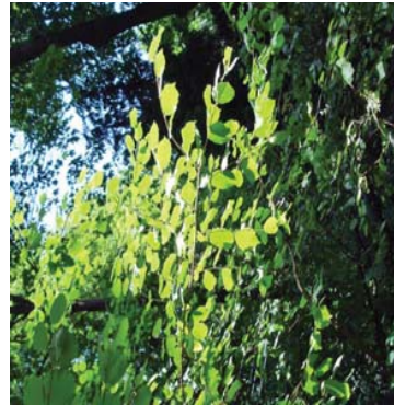
Beaked Hazelnut 5' to 15' tall 5' to 12' wide Yellow fall color