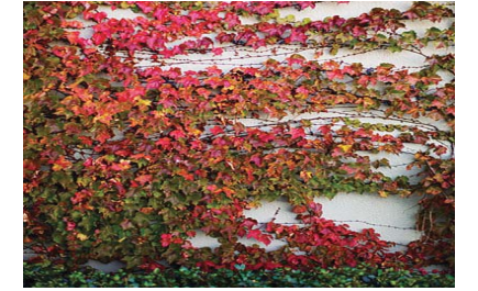
Boston Ivy 10' to 20' tall 8' to 15' wide Deciduous Red fall color 2' wide min. area required

Note: Both available ground space for root growth and vertical clearance need to be considered for plant selection.