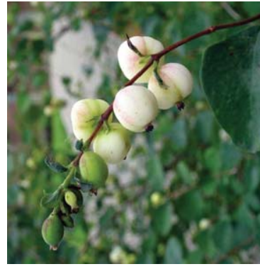
Snowberry shrub 5' to 8' tall 3 to 5' wide White berries

Planted only outside of clear sight line areas and at least 8-feet from trail.