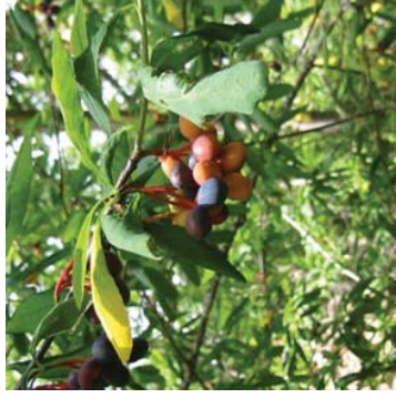
Indian plum 10' to 15' tall 8' to 10' wide Orange/ dark blue berries