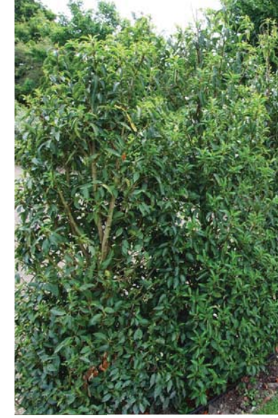
Portugese Laurel 15' to 20' tall 8' to 15' wide Broadleaf evergreen Solid screen, trim to hedge 6' wide min. area required