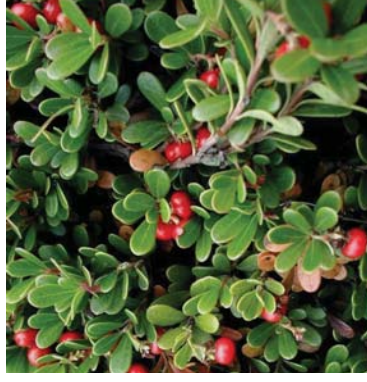
Kinnikinnick 3" to 6" tall 2' to 4' wide Evergreen