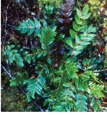
Low Oregon grape 1' to 2' tall 1' to 2' wide Evergreen