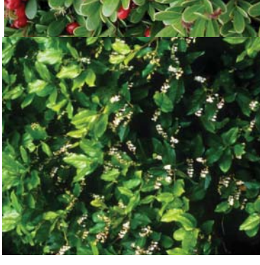
Salal 1' to 3' tall 1' to 4' wide Evergreen