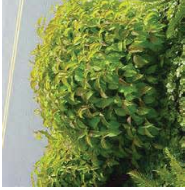
Dwarf redtwig dogwood 1' to 2' tall 2' to 3' wide Red stems

Can be planted closer to pavement and inside of clear sight line areas.