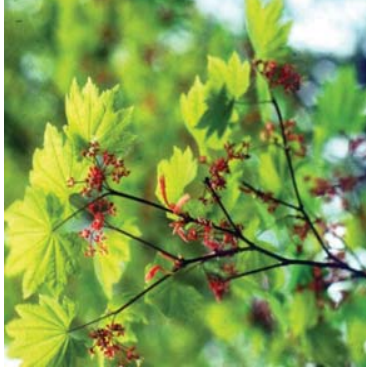
Vine Maple 10' to 20' tall 8' to 15' wide Orange/red fall color