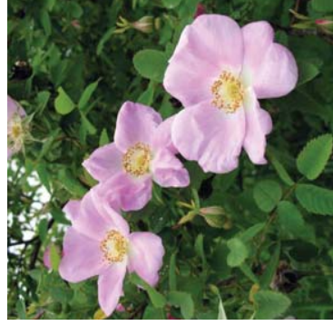
Nootka shrub rose 5' to 8' tall 3 to 5' wide Pink flowers, red hips