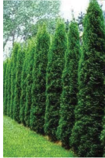
Pyramidalis Arborvitae 12' to 25' tall 3 to 4' wide Evergreen conifer Space close for solid screen 3' wide min. area required