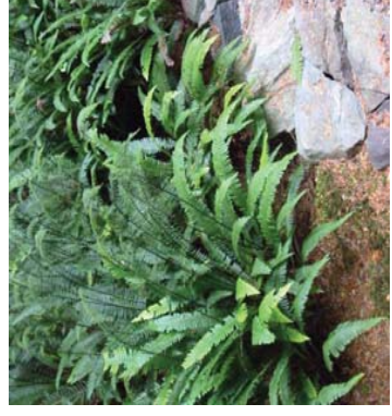
Deer or sword fern 1' to 2' tall 1' to 3' wide Evergreen