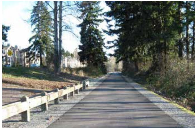
Redmond segment of the East Lake Sammamish Trail

PRSR STD U.S. Postage PAID Seattle, WA Permit No. 563