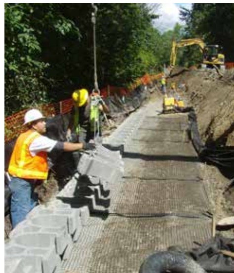
The North Sammamish trail segment will be closed during construction. For safety purposes, and to clearly identify the trail as a construction zone, the Contractor will install temporary construction fencing along the trail corridor.