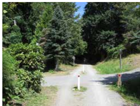
Intersection before; South Sammamish segment