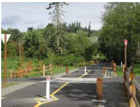
Intersection after; Issaquah segment