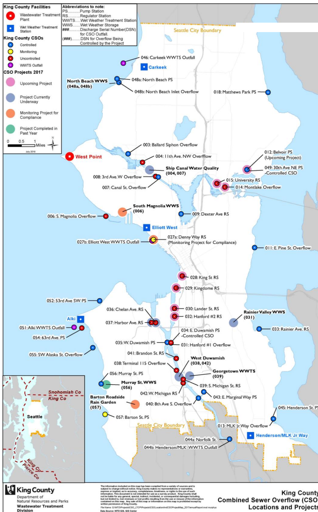
Figure 3. King County CSO Control Projects