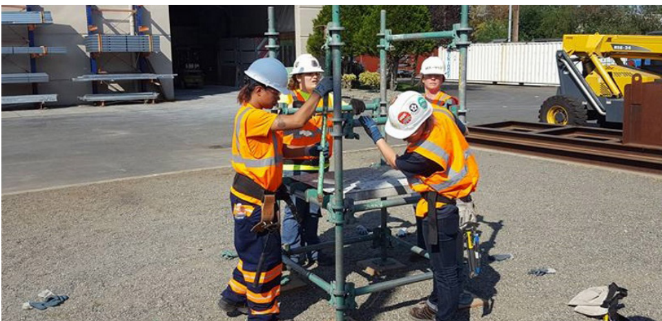
A regional Small Contractor & Supplier (SCS) on the job