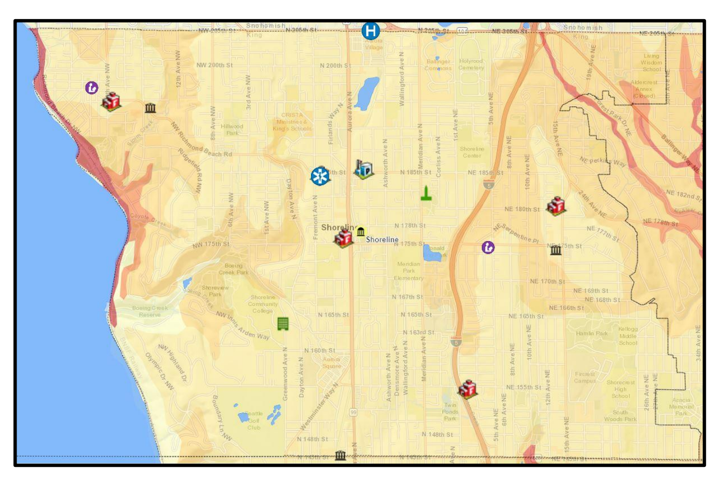
Figure 2: Liquefaction Hazard (map source King County Hazard and Vulnerability ArcGIS)