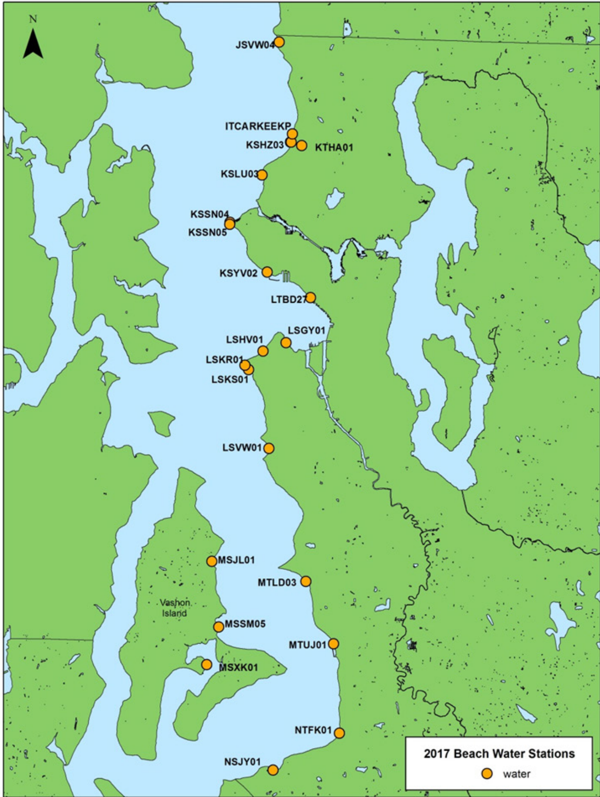
Locations of beach water quality sampling sites.