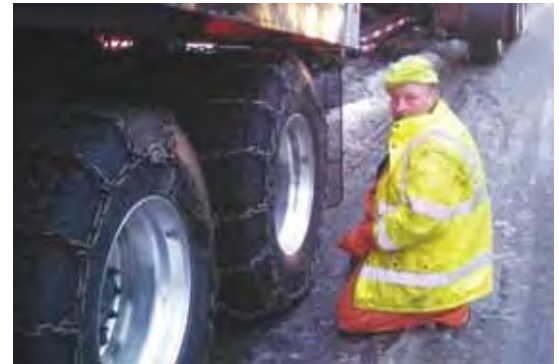
A Loop truck driver putting on tire chains to cross Snoqualmie Pass during February snowstorms.

King County is proposing to expand biosolids trucking hours in the City of Seattle to meet current federal regulations that restrict maximum driving time, helping to protect public safety. Improved trucking hours would also reduce traffic impacts in the City of Seattle, along with reducing fuel consumption and greenhouse gas emissions from trucks idling in traffic.