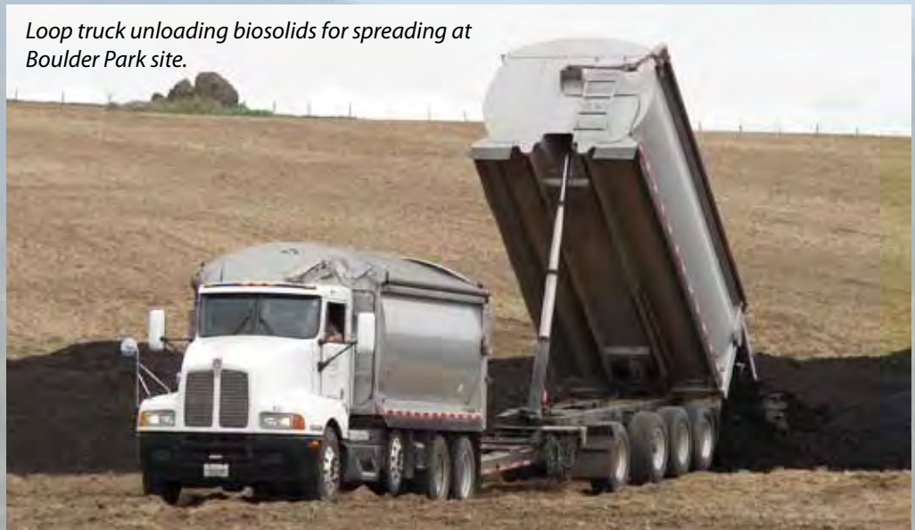
Loop truck unloading biosolids for spreading at Boulder Park site.

This proposal requires approval by the Seattle City Council, with opportunities for the public to comment on this proposal as part of the process. In addition to City notifications, King County will post information about the process on the West Point Web page.