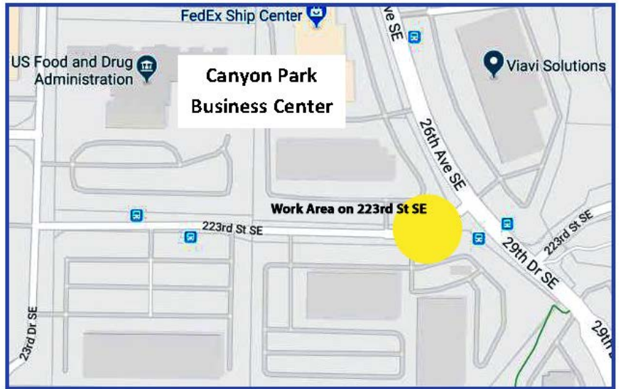
Paving work area along 223rd Street SE in Canyon Park