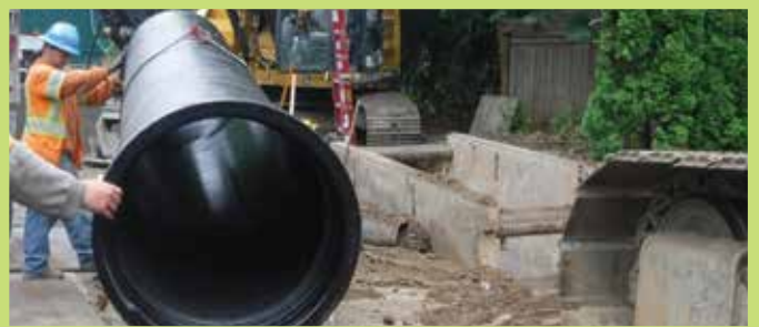
MAY – Open cut pipe installation on 164th Pl SE began.