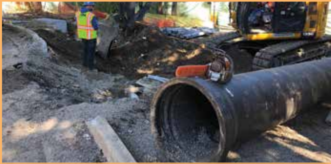
MARCH – Crews filled in the hole they dug to install the pipe under SE 35th PI and 164th PI SE.