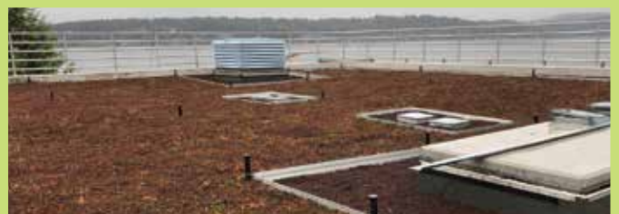
OCTOBER – Crews finished installing the green roof on Sunset Pump Station. We designed the green roof to reduce runoff and improve water quality.