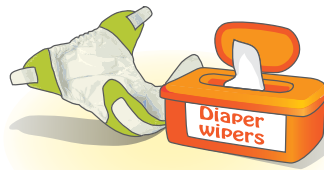
Disposable diapers, nursing pads & baby wipes