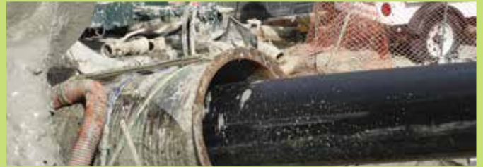
MARCH – Crews pulled 1900 linear feet of pipe from Lake Sammamish, where it was being stored, into a borehole underneath SE 38th St.