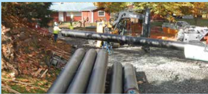
DECEMBER – Crews fused smaller segments of pipe into one long piece of pipe that was stored on Lake Sammamish.