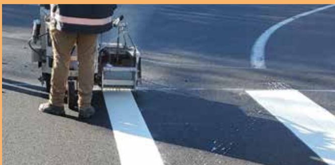
NOVEMBER – Final road restoration and striping along SE 35th PI, 164th PI SE, and SE 38th St. completed.