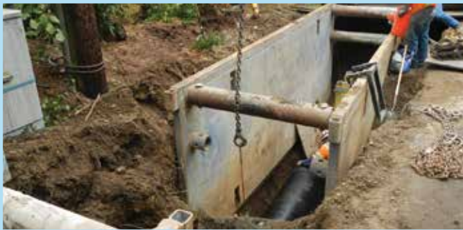
SEPTEMBER – Construction began; sewer pipe installed under SE 35th Pl.