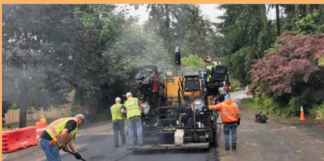
JULY/AUGUST – Pipe passed testing and was ready to carry wastewater. Sidewalk and road restoration began.