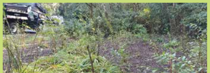
FALL – Wetland restoration and enhancement installed along 164th Pl SE; native plants and shoreline habitat added at the Sunset Pump Station.