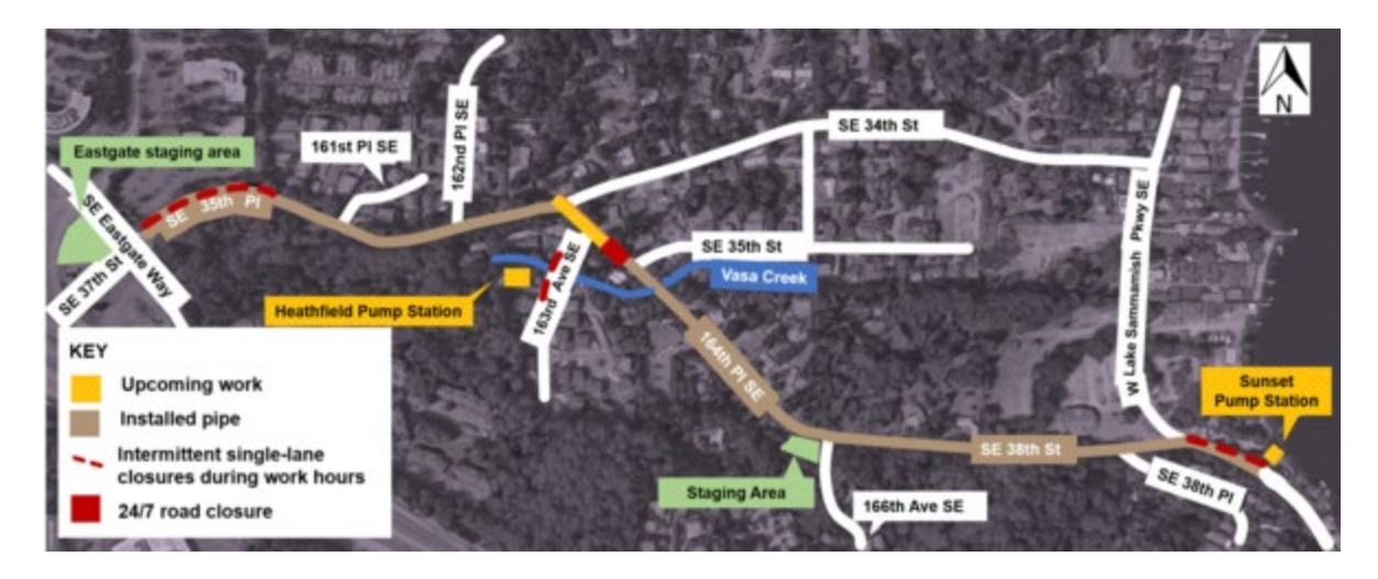
Ongoing road and lane closure information is posted on the project website. Until all pipe installation is done, and road closures are lifted, we will update the website as conditions change.