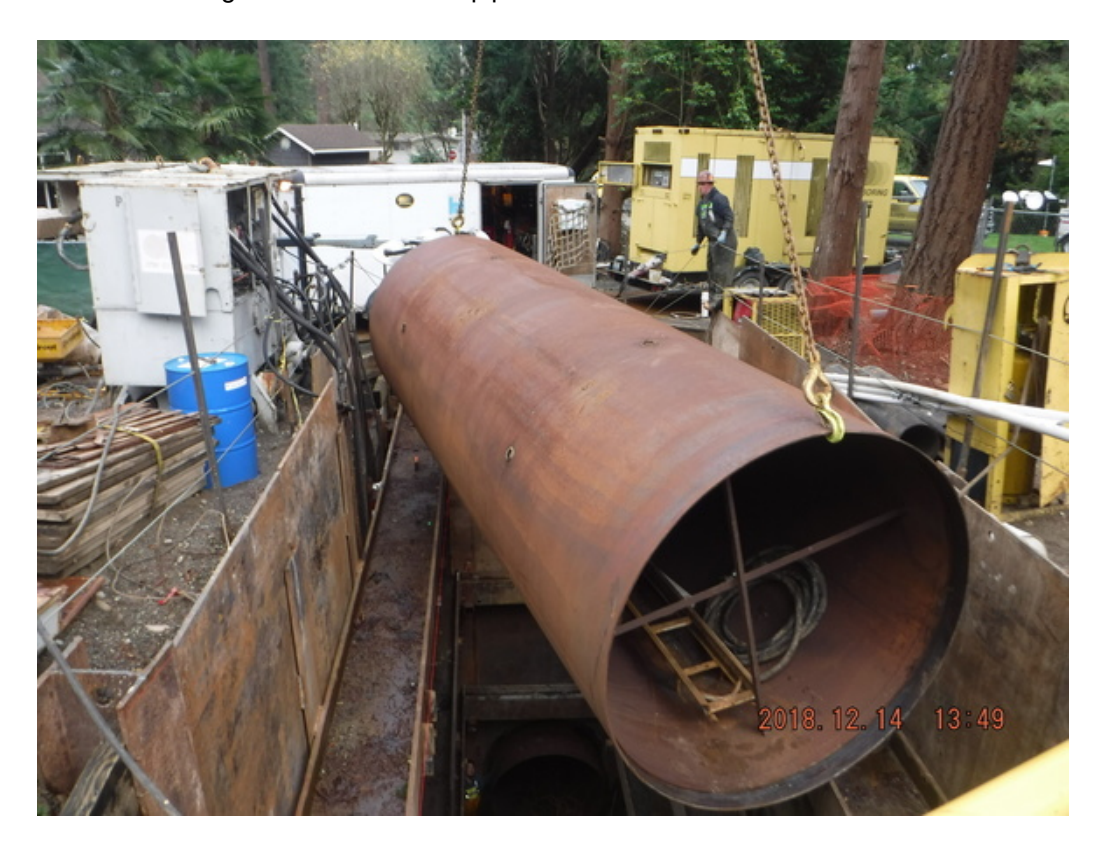
A segment of pipe being lowered into the pit for installation. The pipe is six feet wide.