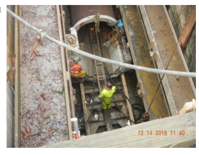
Workers install pipe in the pit 32 feet underground.

Please do not rely on the electronic signs posted on the road for schedule information. Those signs convey the estimated duration of a specific construction activity - not the entire project, as required by the City of Bellevue.