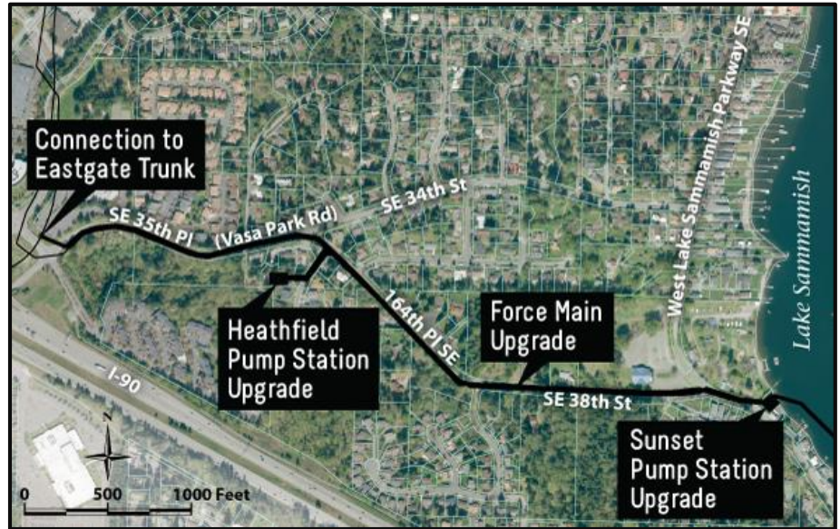
The project area is located in Bellevue between Lake Sammamish and I-90.

Population growth in the area has increased the use of the sewer system and the pumps are reaching their limit. This project will upgrade the pump stations and the connected sewer force main pipe. Once upgraded, the system will have the capacity to serve the region for years to come.