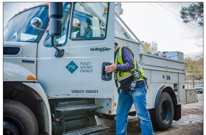
PSE crews at work

All planned construction is tentative and subject to change based on work area conditions.