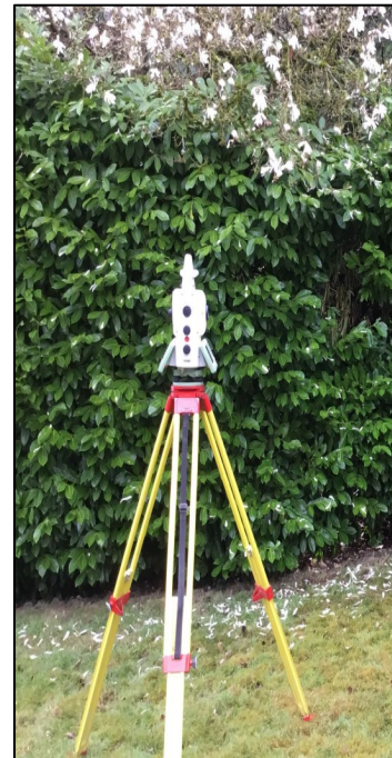
Crews will use survey equipment to measure and photograph trees.