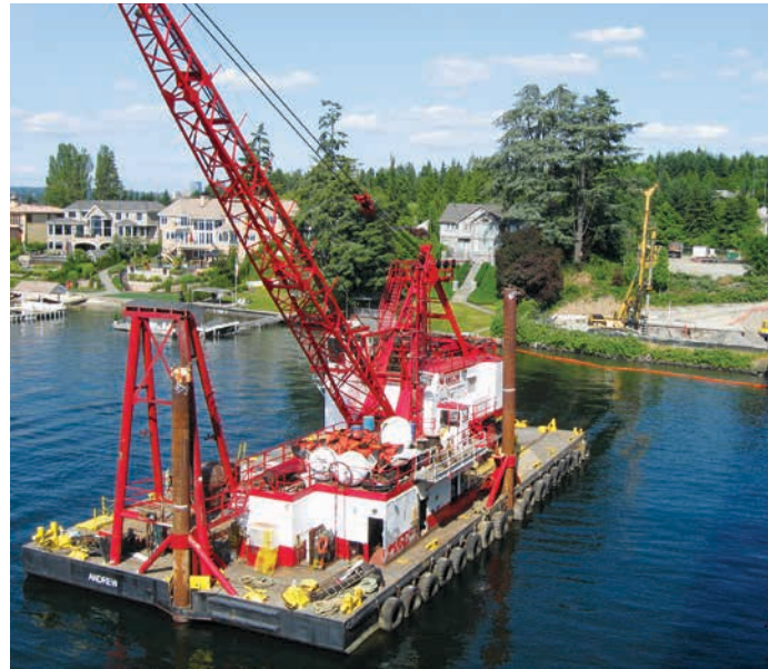
Crews worked from a barge this summer to gather information about alignment conditions

This fall, the project team will continue geotechnical and site analysis. We expect to make a final decision about where the pipe will be placed by the end of the year. Early next year, we will be out in your community to share information, gather your thoughts and hear your input.