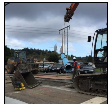
An example of pipe installation