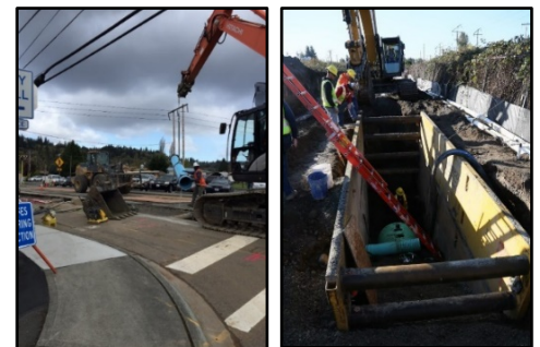
Crews will install pipe using open cut construction.

For more information: visit us at www.kingcounty.gov/kent-auburn-csi or call the project information line: 206-205-9283