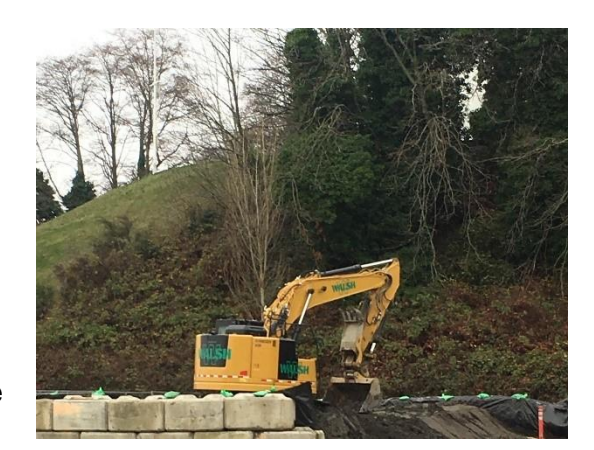
Crews continue work in the southwest corner of the Smith Cove Park site.