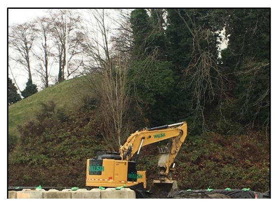
Crews continue to excavate at Smith Cove Park to prepare the site for the installation of ground support