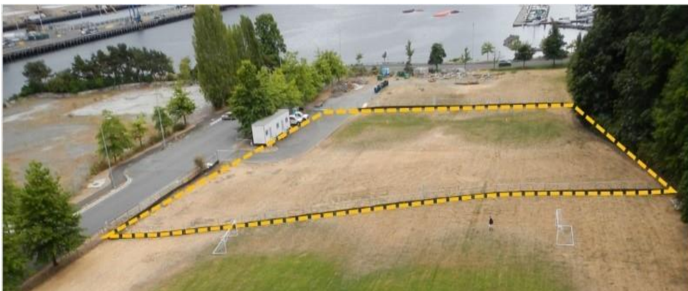
Athletic field at the south end of Smith Cove Park is expected to be closed through July 2018

Starting this week, crews will begin assembling shoring boxes. Later in the week, beginning as early as Thursday, December 14, crews will begin excavation in preparation for installing shoring boxes near the entrance of the existing pipe in the southwest corner of the Smith Cove Park athletic fields. Shoring boxes are used to hold soils back during excavation for underground construction. Expect increased noise typical of a construction site.