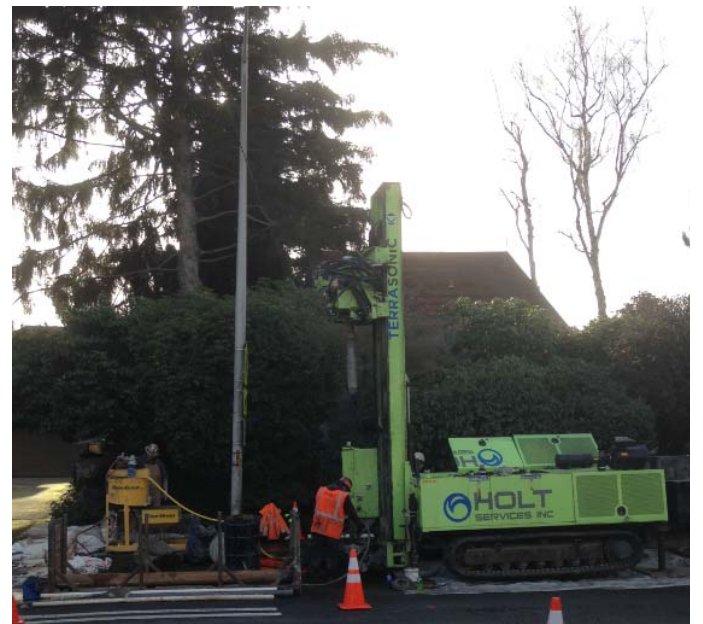
Crews use a small drill rig to help confirm the pipe break's location. Any areas of soil loss found along the damaged pipe are filled with grout.

King County must repair a damaged pipe designed to send flows to the County's Magnolia Wet Weather Storage Facility. The pipe and facility work together to keep sewage and stormwater out of Puget Sound during storms and prevent Combined Sewer Overflows (CSOs).