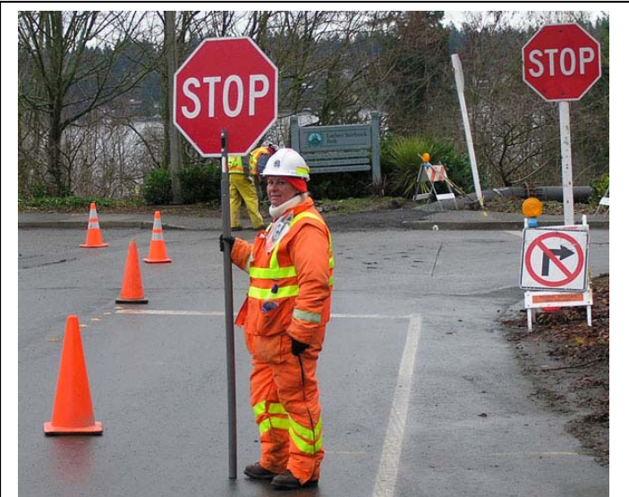
Traffic flaggers will detour cars, bikes and pedestrians around the work area