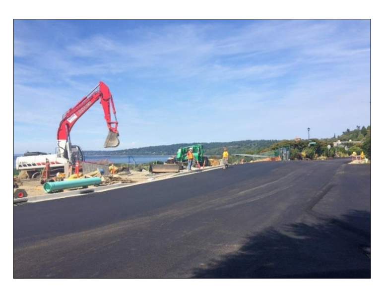
Intersection on August 26, 2015. Crews are preparing the intersection for reopening on Monday, August 31.