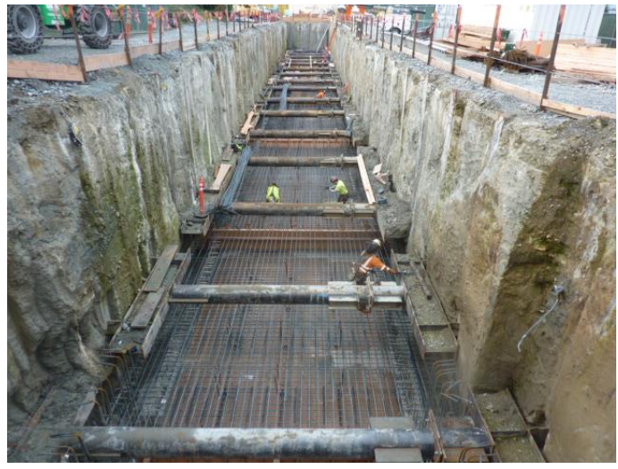
Crews place rebar for the top of the CSO tank in preparation for pouring concrete.