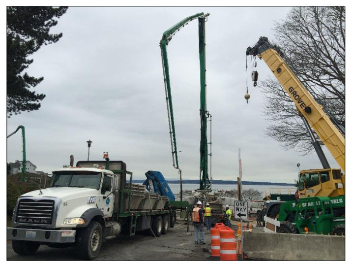
The contractor poured 300 cubic yards of concrete on Monday, continuing to form the CSO tank base.