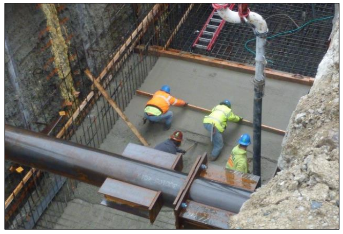
Crews finish a section of the CSO tank slab after the concrete is poured.