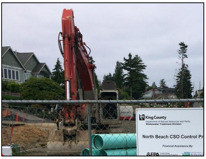
Typical construction equipment on site now.

Shoring is a general construction term that refers to methods used to keep excavations open during underground construction, essentially preventing the surrounding soils from running into the excavation. Many different shoring methods can be used depending on the type and size of excavation, surrounding soils, and water table.