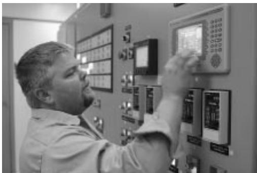
Operator checks new pump station controls

This newly upgraded facility will serve customers in the north portion of our service area for at least the next 50 years.