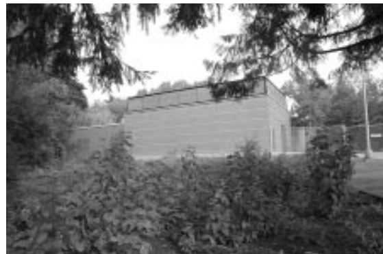
Landscaping with native plants enhances the Thornton Creek riparian corridor