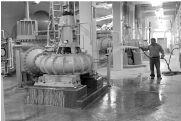
New pumps help ensure reliable future operation