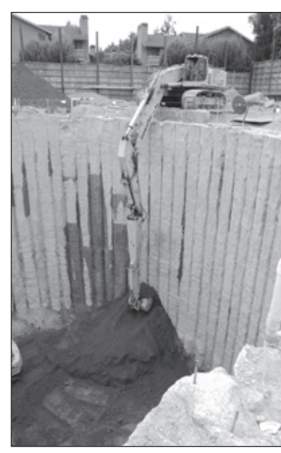
Crews excavate soil to build pump station foundation

During the last two months, crews have excavated over 10,000 cubic yards of soil as part of constructing the new pump station foundation. The base of the pump station is located approximately 55 feet below street level. In addition. a 25-foot-wide by 40-foot-deep access shaft was excavated in the staging area to accommodate the microtunnel boring machine (MTBM).