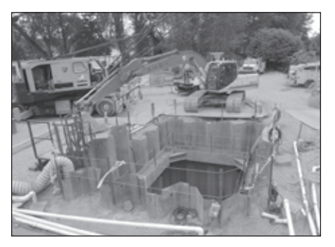
MTBM access shaft

Some late night work, lasting about a week, may be required in late August or early September, while the new sewer is microtunneled under Northeast Juanita Drive.