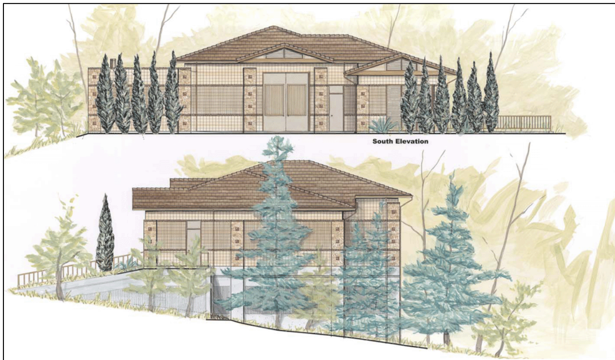
New Hidden Lake Pump Station (South elevation (front) and east elevation (side))