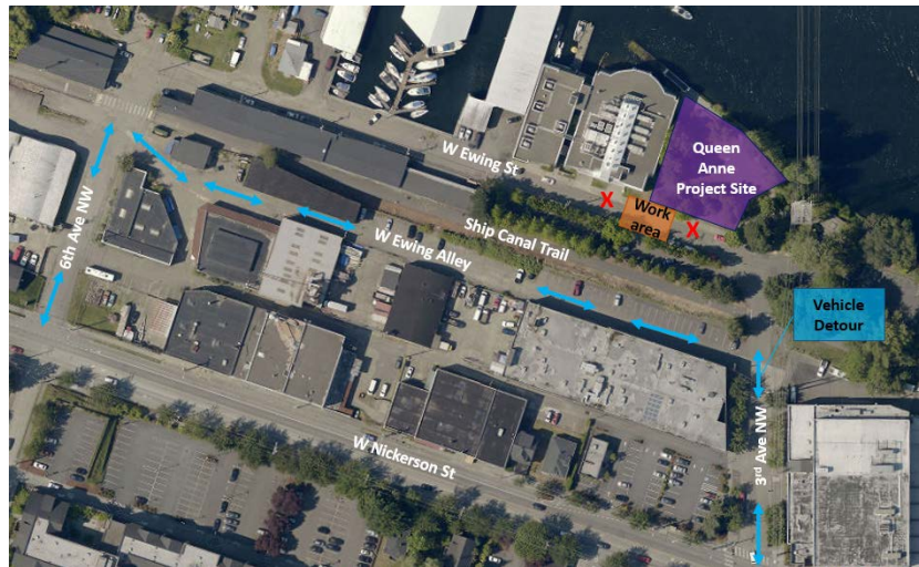
Traffic can detour to the W. Ewing Alley when W. Ewing St. is closed