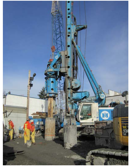
Crews will install secant piles before digging the launch shaft for the tunneling machine.

ALTERNATIVE FORMATS AVAILABLE 206-477-5371 / 711 (TTY RELAY)