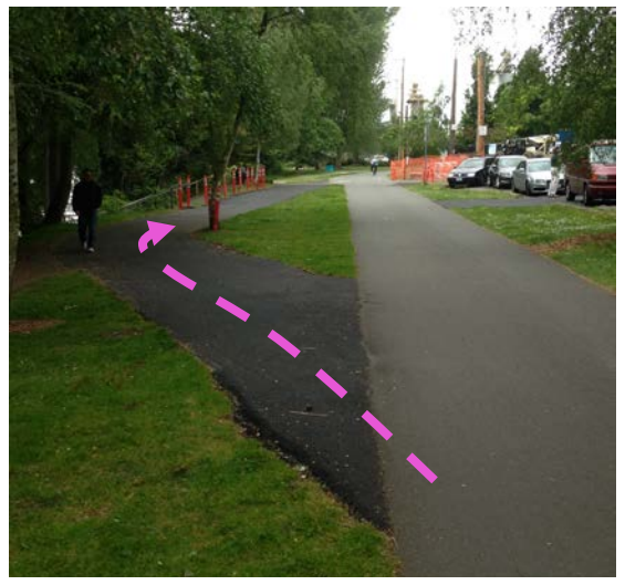
The Burke-Gilman Trail will detour south during work in Fremont Trail Park. Trail users can enter the trail at 3rd Ave NW or 1st Ave NW.

Please avoid the project area and sidewalks on 36th Ave NW next to the project area. Please do not engage individuals working at the site. Community members can ask questions or share concerns about the project 24 hours a day by calling the project information line (206-205-5428).