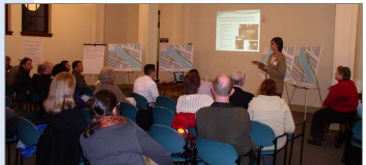
King County invites communities to meetings to learn about the project during design and prior to construction