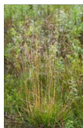
Tufted Hair Grass