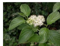
Red Twig Dogwood