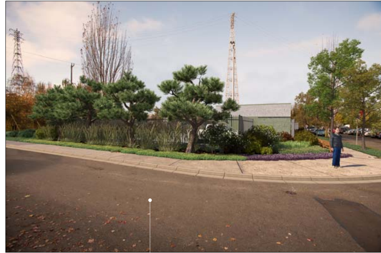
2nd Ave NW