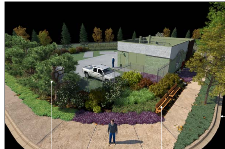
Screening trees New benches