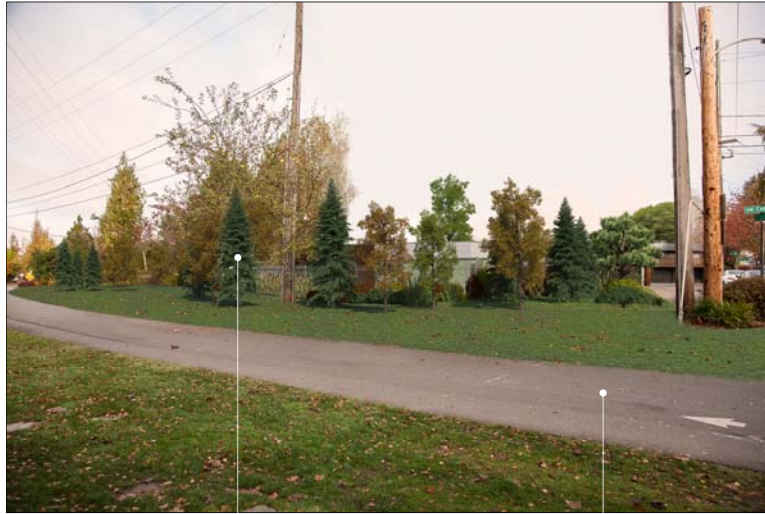
Screening trees Burke-Gilman Trail