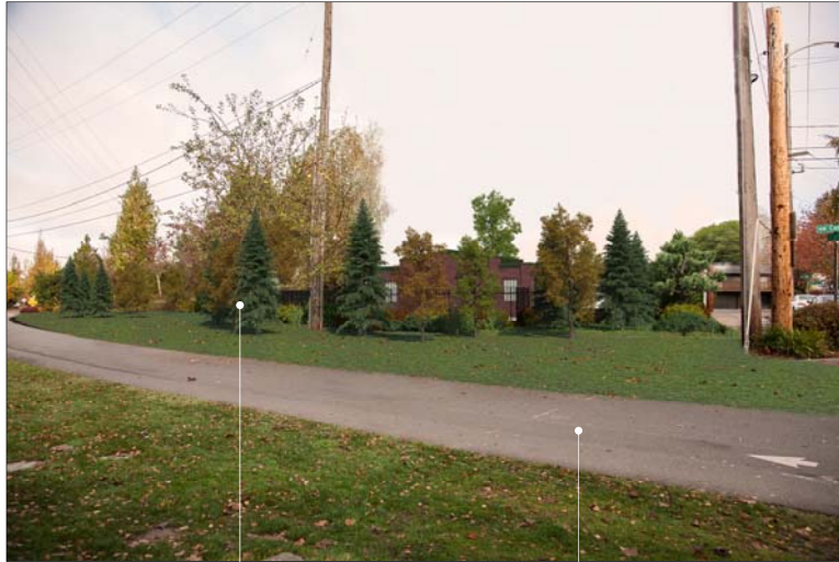
Screening trees Burke-Gilman Trail