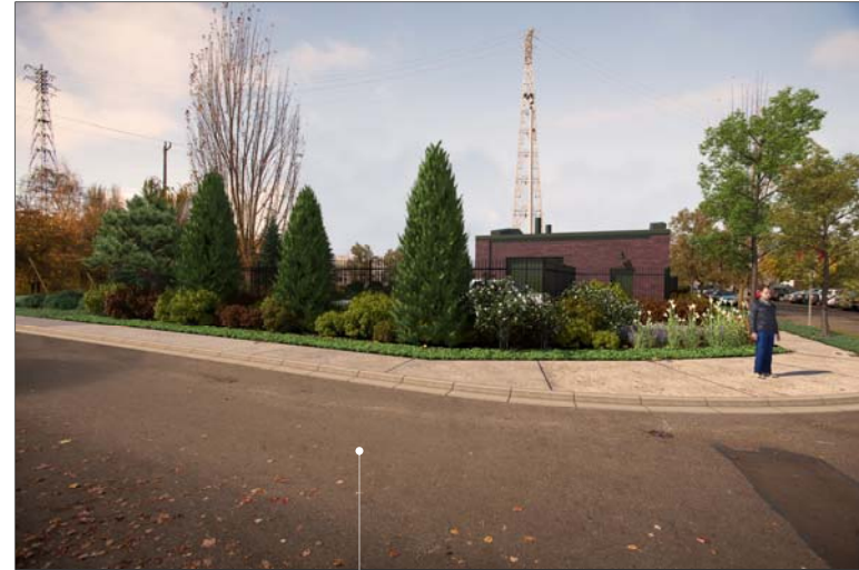
2nd Ave NW