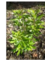
Pacific Wax Myrtle