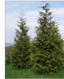
Western Red Cedar