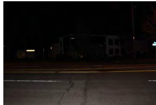
Views from Leary Way Northwest