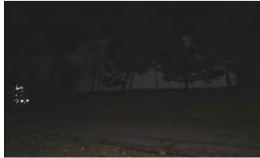
Views from the Burke-Gilman Trail