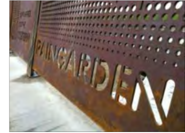
Panels of interpretive or contextual graphics