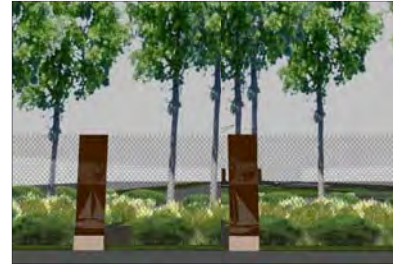
Panels of interpretive or contextual graphics incorporated into chain link