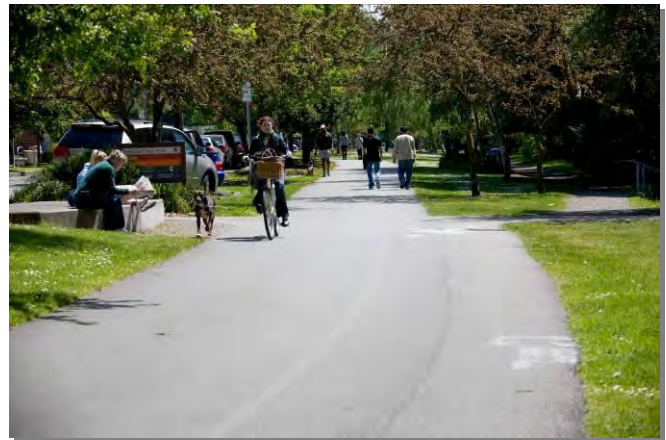
The Burke-Gilman Trail in the Fremont Canal Park