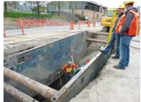
A trench box for sewer line installation