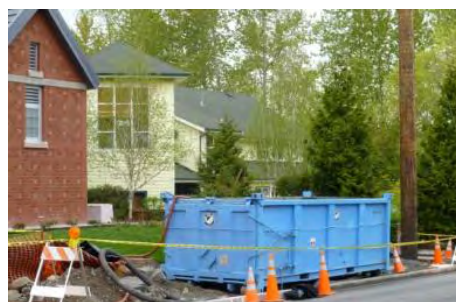
Dewatering tanks in public right-of-way

The King County Bellevue Influent Trunk and the City of Bellevue West Central Business District (CBD) Trunk lines will be upgraded to provide the required capacity to accommodate recent and projected growth in Bellevue. The existing sewer line, originally constructed in 1966, is corroded and has reached maximum capacity.