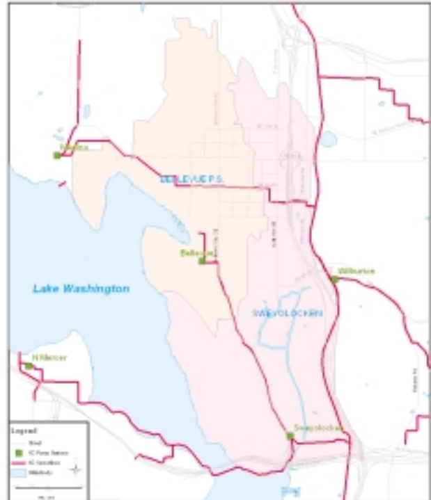
Areas served by the Sveyolocken and Bellevue Pump Station.

As part of the Regional Wastewater Services Plan passed by the King County Council in 1999, the entire wastewater system was evaluated for its ability to safely and adequately convey and treat the region's wastewater. Several King County pump stations are nearing the end of their ability to adequately pump the volume of wastewater from the areas they serve. Also, these older buildings must be updated to current seismic codes and for safety, odor control and reliability.