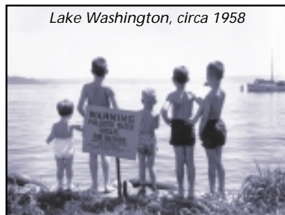
Lake Washington, circa 1958

King County assumed the functions of Metro in 1994 and now operates the regional treatment plants in Renton and Seattle, 42 pump stations and 335 miles of pipe.