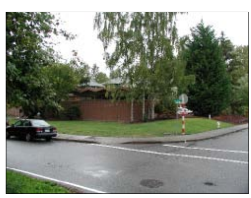
SE 6th ST. & 102nd Ave. SE