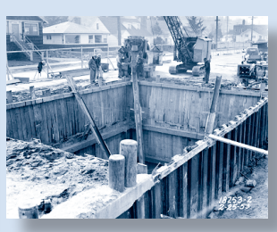
Large equipment and construction materials will be here as the underground pump station is again improved.

1953 at the site of the original 53rd Avenue Pump Station. The facility was later upgraded in 1962 and 1985.