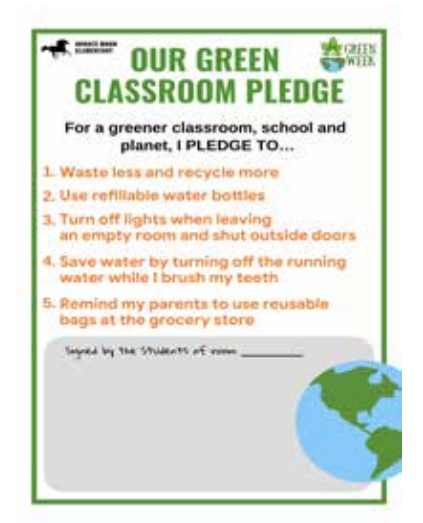
Green Classroom Pledge 2019

Green Team participants reviewed the Green Schools Program Level Two Energy Conservation Best Practices Guide as they learned about and worked on energy conservation strategies.