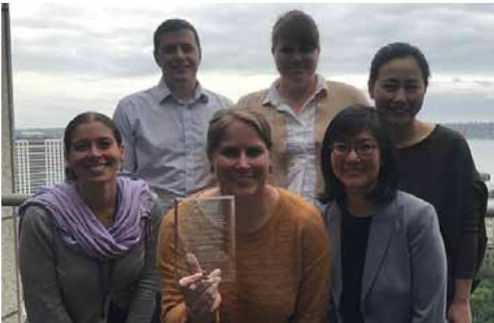
The Best Starts for Kids data team show their award from the Robert Wood Johnson Foundation.

In total, there are 53.45 FTE hired across both the Department of Community and Human Services and Public Health—Seattle & King County that are supported by Best Starts funding. Twelve more open positions are being recruited to support program strategy areas. Communities of Opportunity hired its Executive Director in December 2016 and brought on two support program managers and an administrative specialist to establish the infrastructure necessary for implementing and distributing the Best Starts’ funding connected to Communities of Opportunity.