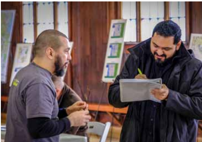
3,500 residents participated in job fairs and other employment events supported by COO.

Place-based solutions and policy/system change solutions are most effective when community partners have key roles in leading, shaping and implementing change in their communities.