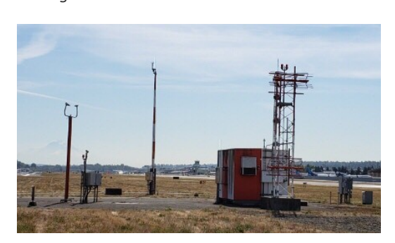
The Runway 14R glideslope antenna and tower, which is expected to be replaced by the FAA this month

Pilots should monitor NOTAMs for facility outage details.