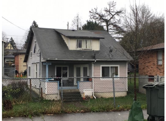
Grade 6/ Year Built 1918/ Total Living 960