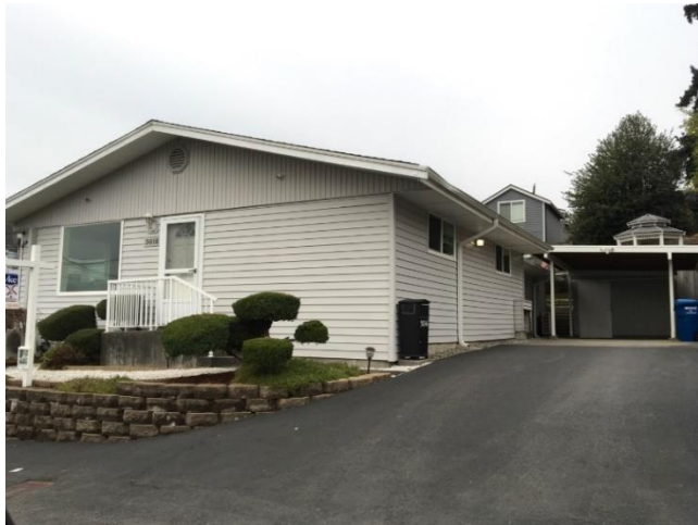
Grade 7/ Year Built 1931/ Total Living 1,580