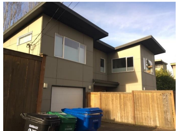
Grade 8/ Year Built 2011/ Total Living 2,190