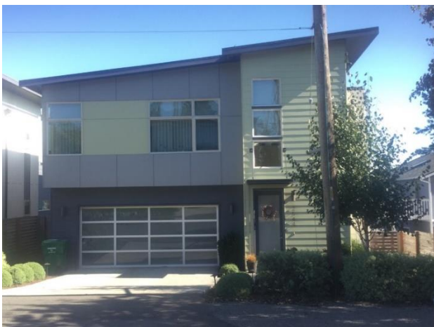
Grade 9/ Year Built 2015/ Total Living 2,680