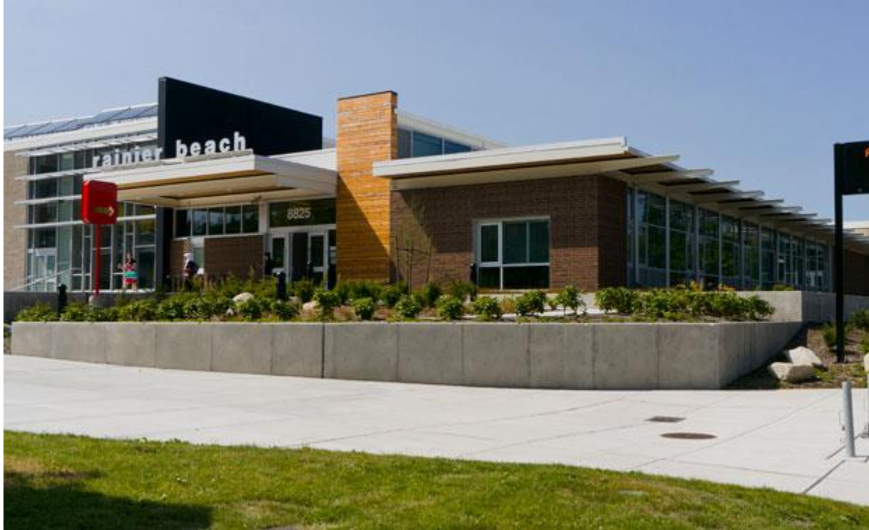
Rainier Beach Community Center