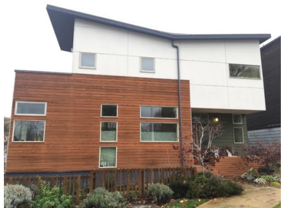
Grade 10/ Year Built 2013/ Total Living 1,460