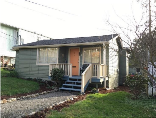
Grade 5/ Year Built 1929/ Total Living 530