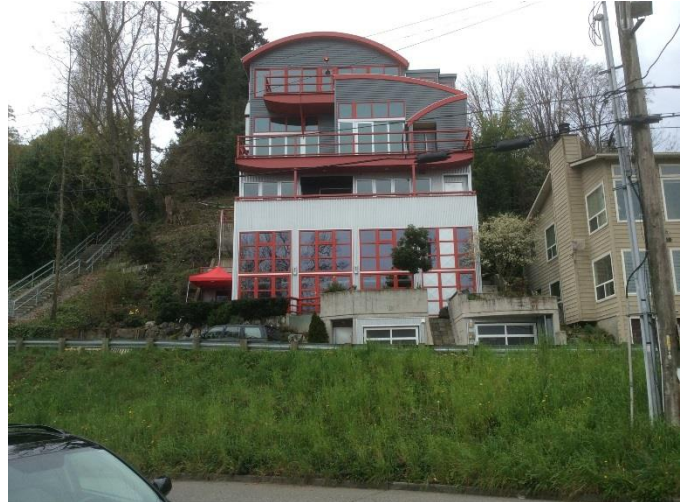
Grade 11/ Year Built 2009/Total Living Area 5330 SF