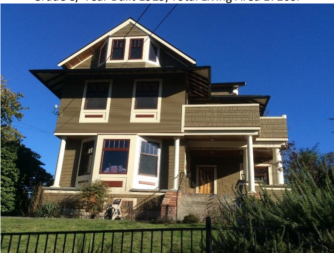
Grade 10/ Year Built 1905/Year renovation 2005/