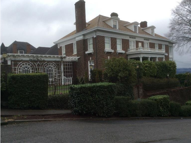
Grade 12/ Year Built 1912/Total Living Area 6370 SF