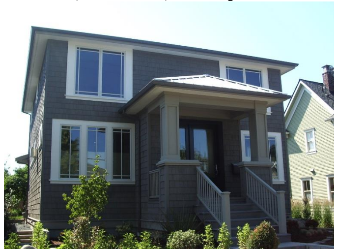
Grade 9/ Year Built 2007/ Total Living Area 3290SF