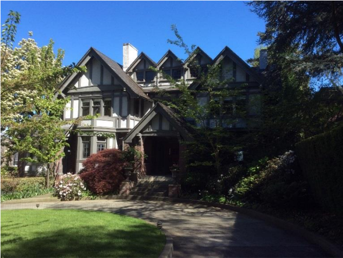
Grade 13/ Year Built 1910/Total Living Area 6400 SF