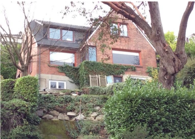
Grade 8/ Year Built 1929/Total Living Area 1720SF