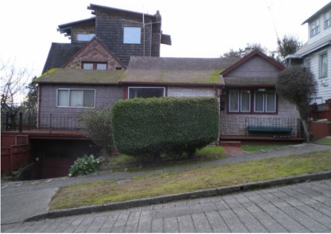
Grade 6/ Year Built 1910/Total Living Area 900 SF