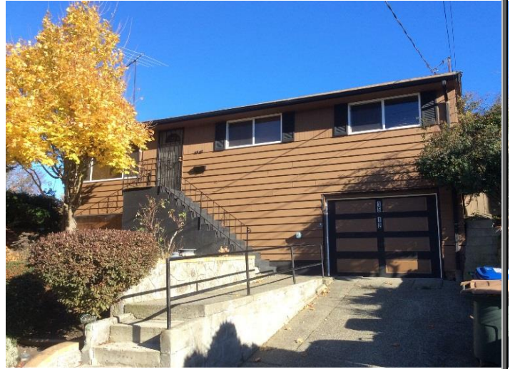
Grade 7/ Year Built 1959/ Total Living Area 1890SF