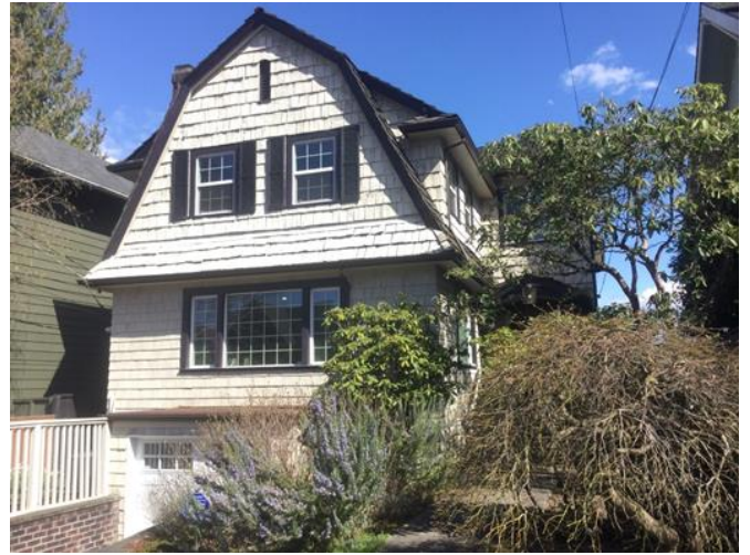
Grade 8/ Year Built 1923/ TLA 3440 SF