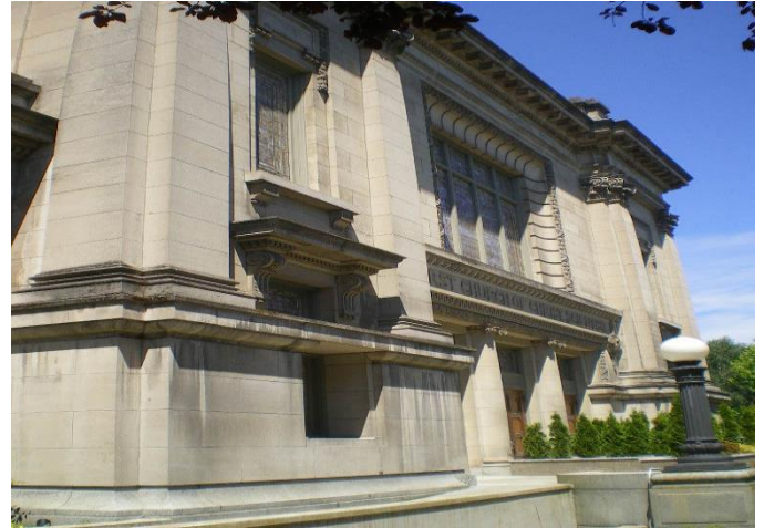
Grade 11 (TH)/ Year Built 2011/ TLA 2,930 SF