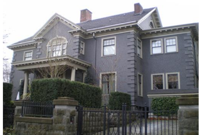
Grade 13/Year Built 1905/TLA 9,845SF