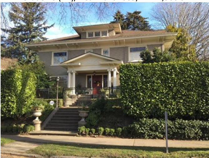
Grade 11/Year Built 1915/TLA 6,160 SF