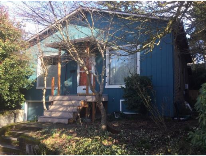
Grade 6/ Year Built 1903/ TLA 950 SF