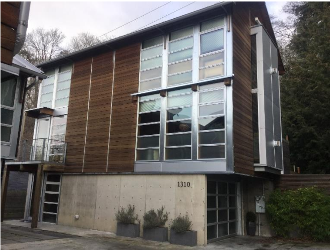
Grade 10 (TH)/ Year Built 2009/ TLA 1,560 SF