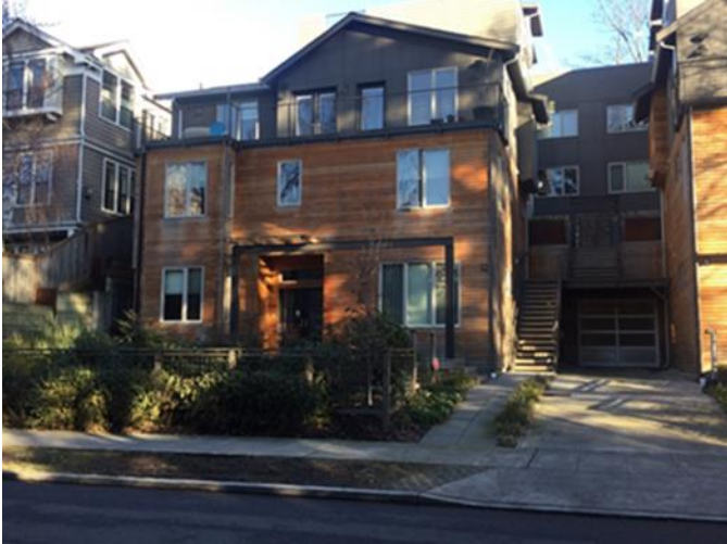
Grade 10/ Year Built 2013/ TLA 2,850 SF