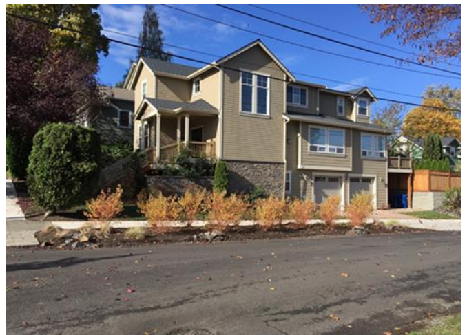
Grade 9/ Year Built 2015/ 2,890 SF