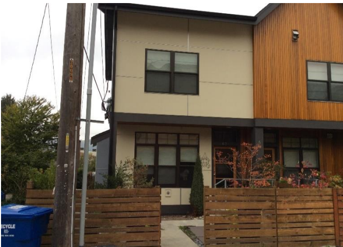
Grade 7 (TH)/Year Built 2009/TLA 1220 SF