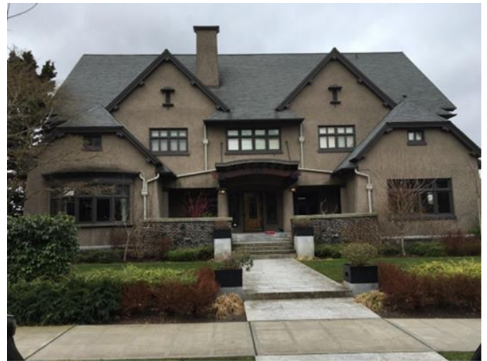
Grade 12/Year Built/Ren 1909/2012/TLA 10,250