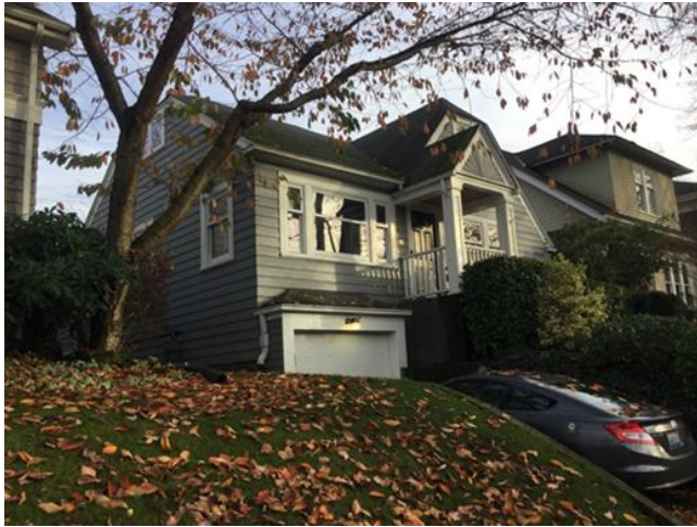
Grade 7/ Year Built 1927/ TLA 1,880 SF