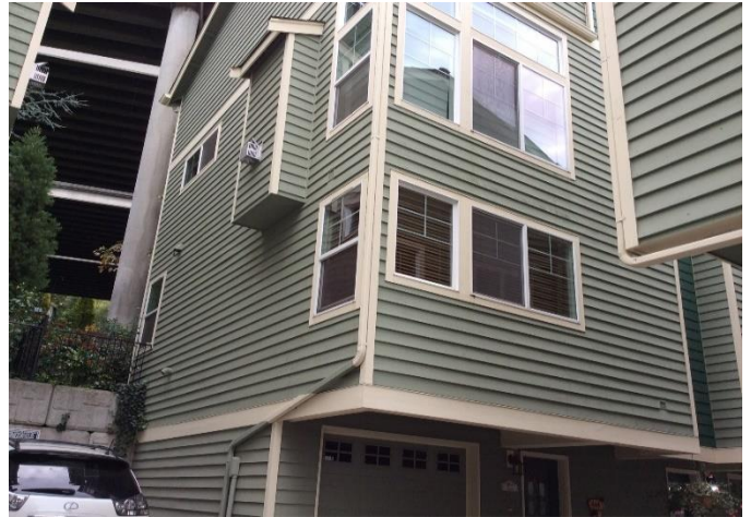
Grade 8 (TH)/Year Built 2004/TLA 1,740 SF