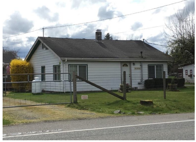
Grade 5/ Year Built 1958 / Total Living Area 1,290