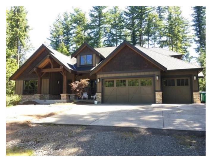
Grade 10 / Year Built 2016 / Total Living Area 3,210