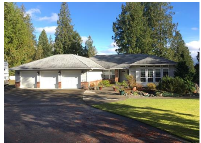
Grade 8/ Year Built 2002 / Total Living Area 2,230