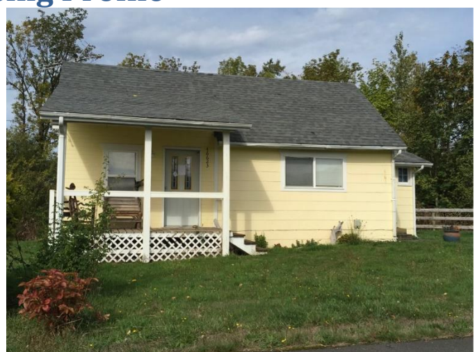
Grade 4 / Year Built 1925 / Total Living Area 620