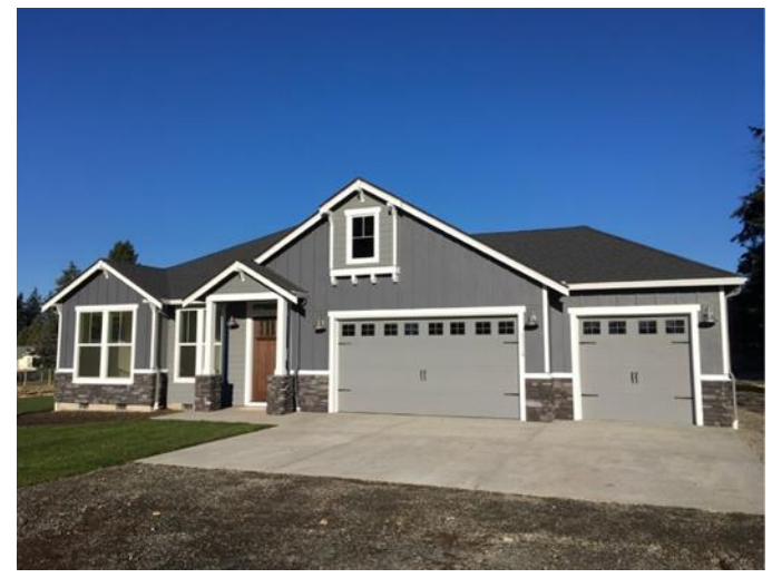
Grade 9 / Year Built 2018 / Total Living Area 2,260