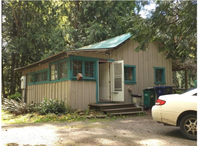
Grade 3 / Year Built 1933 / Total Living Area 530