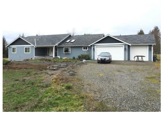
Grade 7/ Year Built 2014 / Total Living Area 2,190