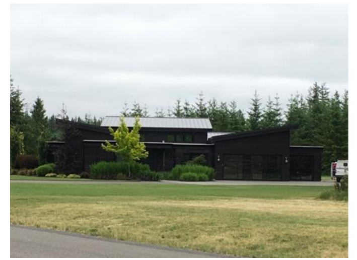
Grade 11 / Year Built 2015 / Total Living Area 3,040