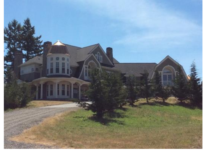
Grade 12 / Year Built 2007 / Total Living Area 8,220