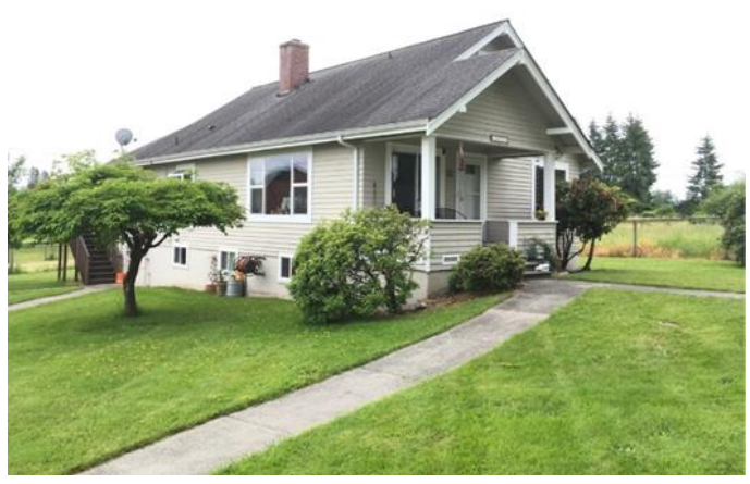
Grade 6/ Year Built 1929 / Total Living Area 1,560