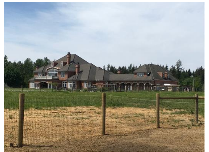
Grade 13 / Year Built 2005 / Total Living Area 9,990