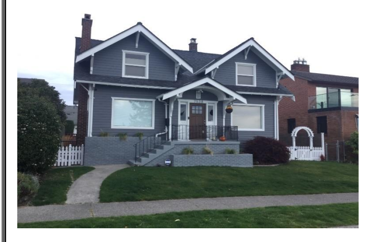
Grade 8/ Year Built 1925/ Total Living Area 2,500