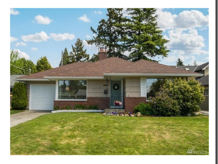
Grade 7/ Year Built 1951/ Total Living Area 1,520