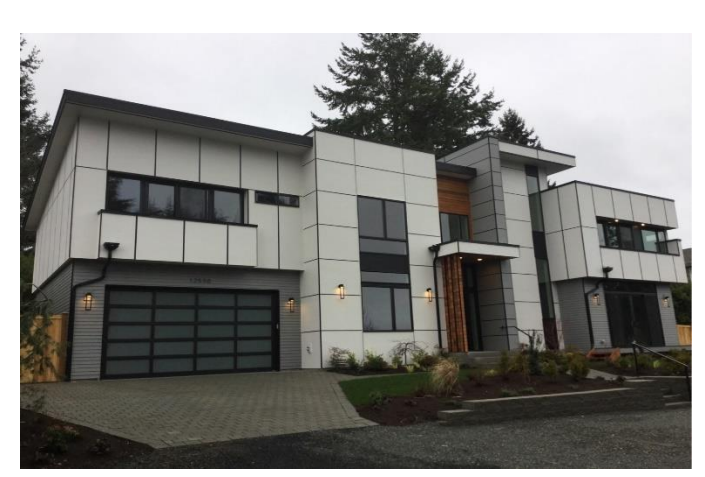
Grade 10/ Year Built 2019/ Total Living Area 3,890