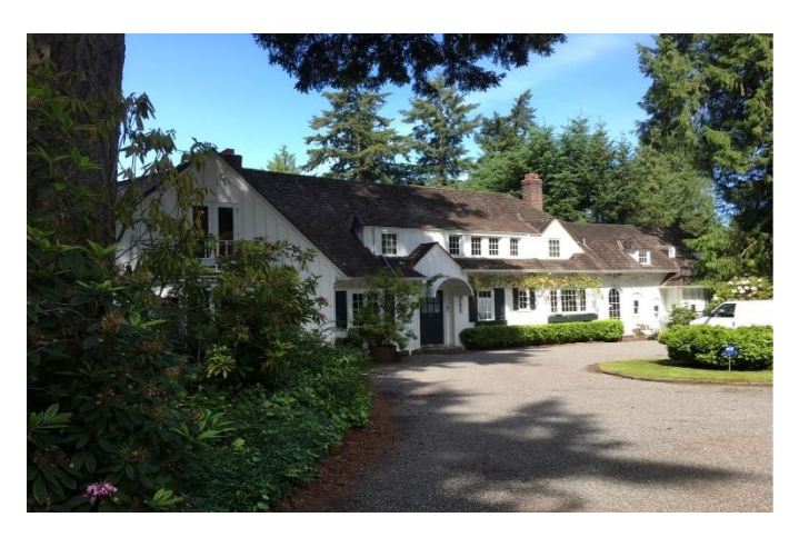
Grade 11/ Year Built 1921/ Total Living Area 4,950

Area 039 Error! Reference source not found. Area Information Dep