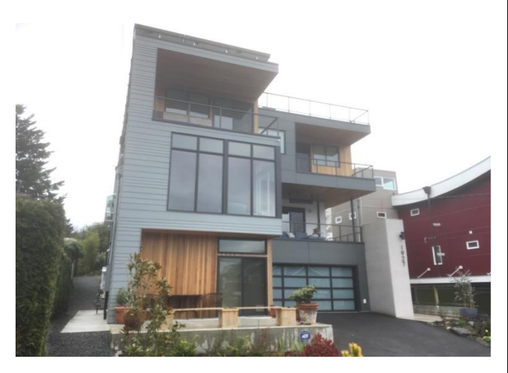
Grade 9/ Year Built 2018/ Total Living Area 3,580