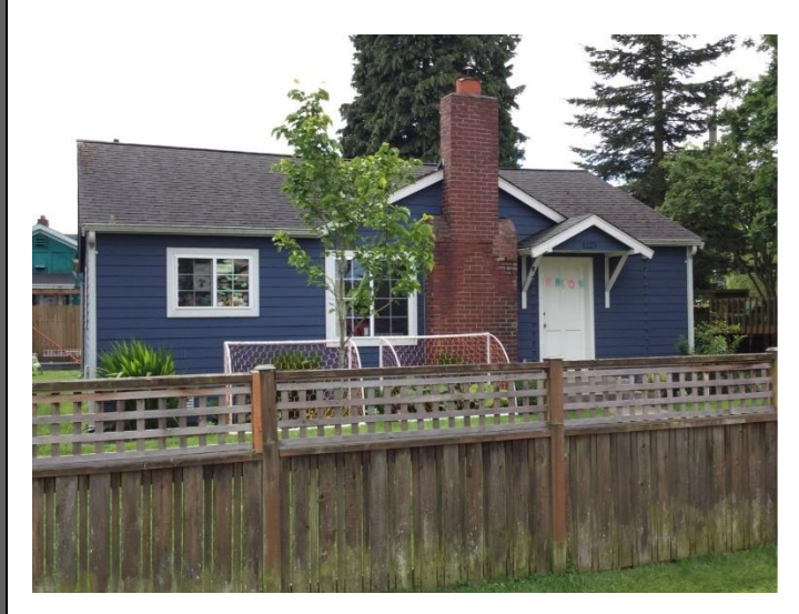
Grade 6/ Year Built 1940/ Total Living Area 940